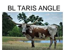
BL TARIS ANGLE