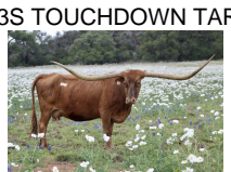
3S TOUCHDOWN TARI