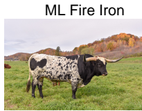
ML Fire Iron