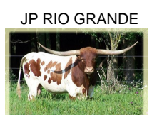
JP RIO GRANDE