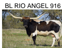
BL RIO ANGEL 916