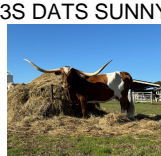
3S DATS SUNNY TARI